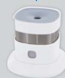
Smart Smoke Detector